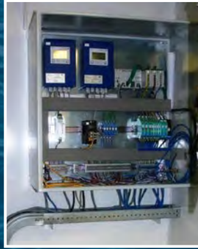
Flow Computer cabinet