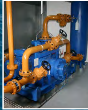
Metering system for diesel measurement