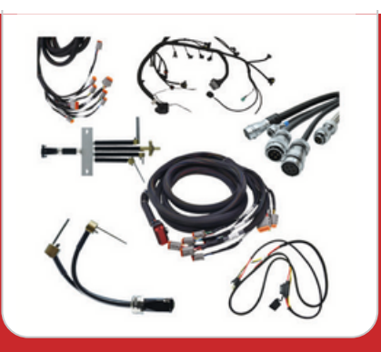
Cable Assembly and Wire Harnessing

As an MSME-registered and ISO-9001 certified enterprise, we prioritise precision, durability, and performance. Additionally, all our parts and components are sourced from verified, reliable vendors to deliver trusted and consistent results.